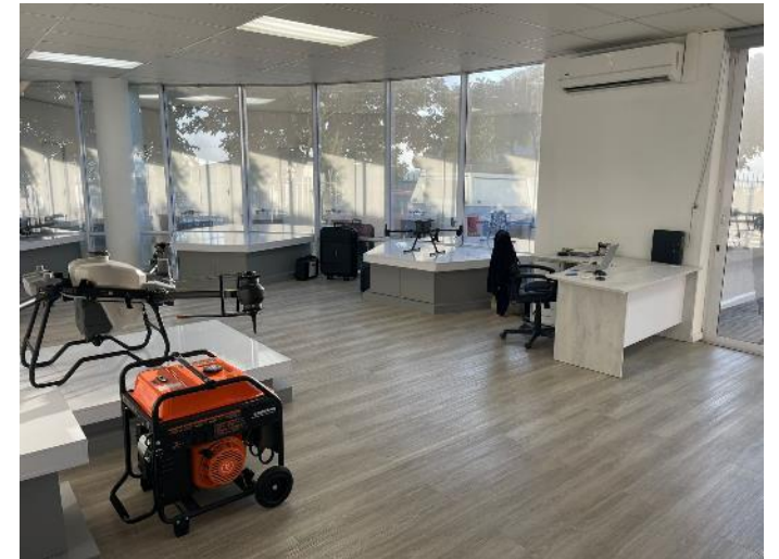
1 st DJI Agriculture Store in South Africa